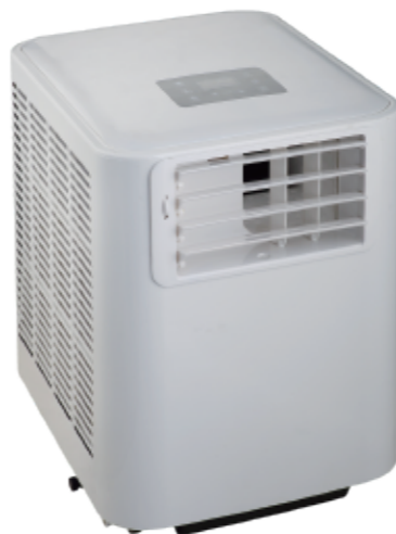
Portable Air Conditioner

Power: H13 HEPA filter: 65W Product Dimension:328*328*696mm Loading Capacity(20/40/40HQ): 200/410/480 pcs Moq: 1*20GP